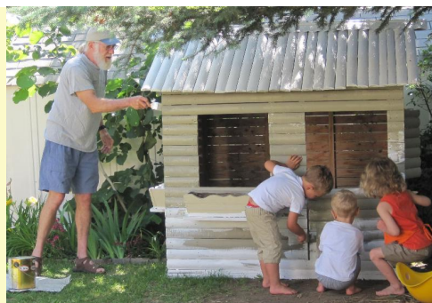
Painting Project at Rainbow Bridge in Boulder, CO